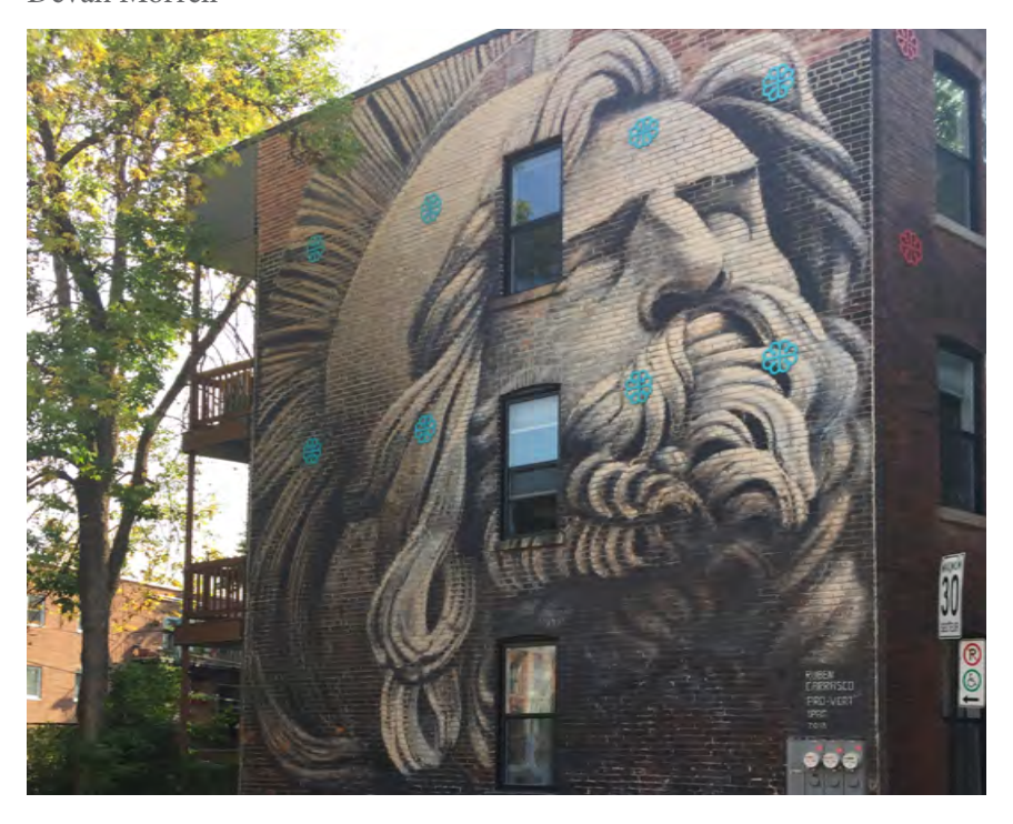
Figure 10. Carrasco, Gillot, and et. al. Philopoemen Blessé. 2016.

and Jamaica who work in the agricultural sector. It has been said that not only do migrant workers fall into debt coming to Canada in order to participate in these work programs, but once they arrive, they experience unsafe and abusive work conditions (including sexually harassment), their wages are often reduced without explanation, and they are subjected to other forms of exploitation. Geten the most vulnerable communities, such as migrant workers, refugees and newly settled immigrants, are the communities most likely to experience food insecurity, and so it is possible that La pomme du savoir is visually rebuking the market-goers for the abundance of reasonably-priced food that locals and tourists alike can buy from local farmers when as local community members go hungry.