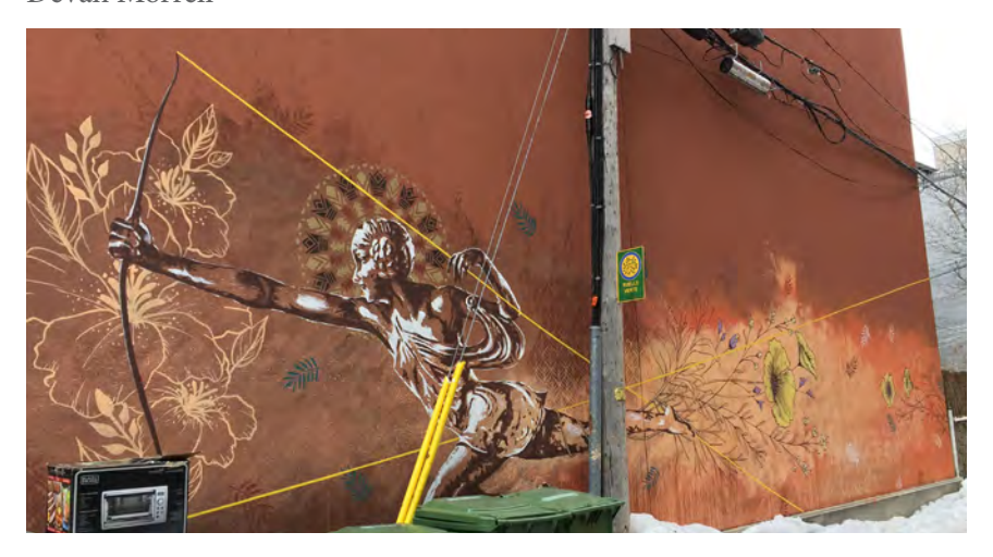
Figure 9. Mateo. La Nature Sauvage D'Artémis. 2018.

La pomme du savoir is meant to be juxtaposed with another of Mateo's pieces called La nature sauvage d'Artémis (2018),89 which is located in the alley behind the corner of Casgrain and Castelnau ( fig. 9). Artemis<sup>90</sup> has a sprig of Myrtle wrapped around her right leg. Myrtle is associated with the goddess of the moon and symbolizes her power to both cause epidemics and source healing. 91 She is shown holding her bow tautly, but her arrow is the one that Minerva, Venus, or the allegorical figure holds in her hand. This is why Mateo suggests that these two images should be considered together - not only to create a scavenger hunt in the city to find and bring these two pieces of the puzzle together, but also to show the balance between global disasters that can lead to food insecurity and malnourishment.92 Someone without the knowledge of Greco-Roman imagery, who walks along the street, meanwhile, may see this image as a warrior woman defending and protecting the natural world. That said, no interpretation is automatically wrong or invalid, even if it deviates from the artist's original intention.