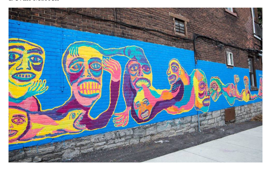
Figure 6. Cedar Eve Peters. Honouring My Ancestors. 2014.

another's enlivened spirit.<sup>73</sup> Post-graffiti reaffirms the vital properties of emotional attachments that help form relationships with, and create interventions in, the urban and natural world. Thus, art and the outdoor environment mingle together like instruments in a musical score to create a symphony between the people and all other non-human natural and human-made agents.<sup>74</sup>