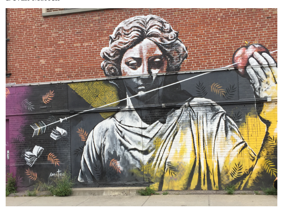
Figure 7. Mateo. La pomme du savoir. 2017.

Greco-Roman post-graffiti art provides a hope for new global opportunities, such as supporting and helping to facilitate other polytheistic figures and themes from around the world that have been suppressed. These post-graffiti projects affirm the impact nature and art have on one another and demonstrate the transformative qualities of the landscape. They also highlight the histories and identities of both the artists who created these pieces and residents, in whose communities the art has been created and displayed. As such, Greco-Roman and Canadian Indigenous post-graffiti art perform in tandem to express the complex historical context of the city.