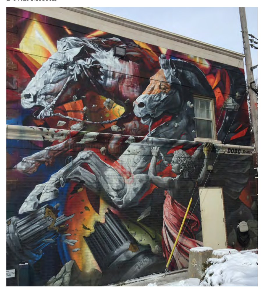
Figure 1. Dodo Ose - Ashop Collective. Inclusion. 2017.

some notable artists are already using unconventional methods to revitalize the cityscape and give fresh meaning to the term street art. Dodo Ose, Mathieu Bories, and Rubén Carrasco along with Damien Gillot are innovating their art by incorporating Greco-Roman themes in their works. While these artists' images share common themes, they are created for their own unique purposes and goals according to the artist's design decisions.