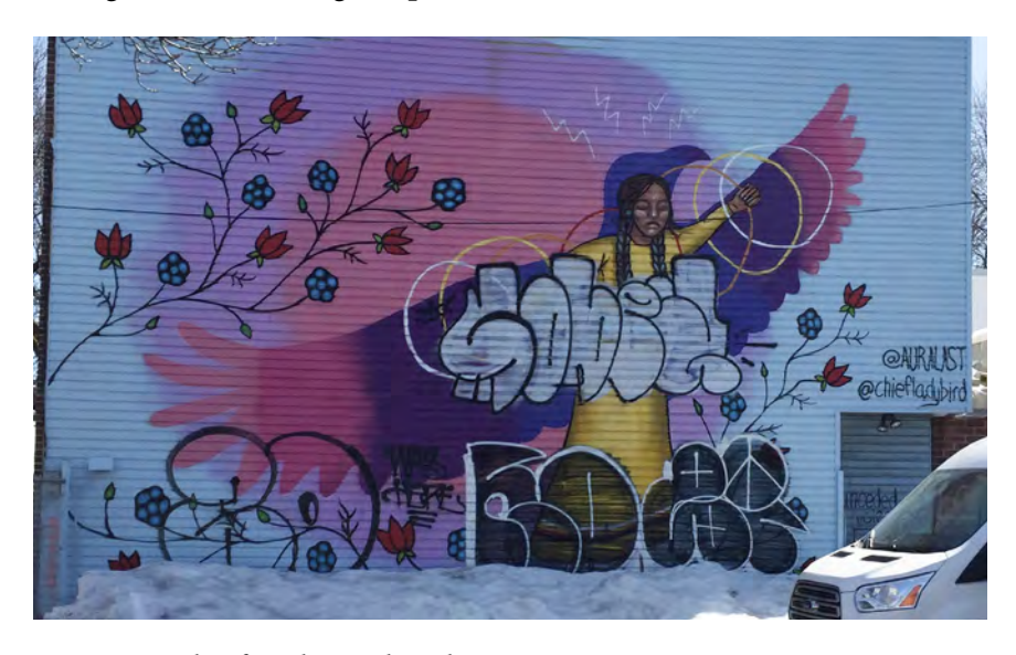
Figure 3. Chief Lady Bird and Aura. Hoop Dancer. 2017.

or male."59 While marginalized and/or racialized individuals were not granted access to these spaces, art produced by those communities remained cherished collection items, demonstrating the "history of colonialism that locates such material almost exclusively in anthropological museums and ethnographic collections."60 By separating the works from the still-living communities that produced them, museums continued to investigate traditional forms through the Salvage Paradigm, an "anthropological term that describes the notion that it is necessary to preserve the so-called 'weaker' cultures from destruction by the dominant culture."61 Through this paradigm, Europeans justified their claims to various lands and resources by stating that the natives were lower on the cultural and evolutionary scale. Therefore, Indigenous peoples were considered unqualified to manage their own affairs and, effectively, their own cultural heritage. European paternalism dictated that non-Europeans needed someone with greater knowledge to preserve their culture for them.