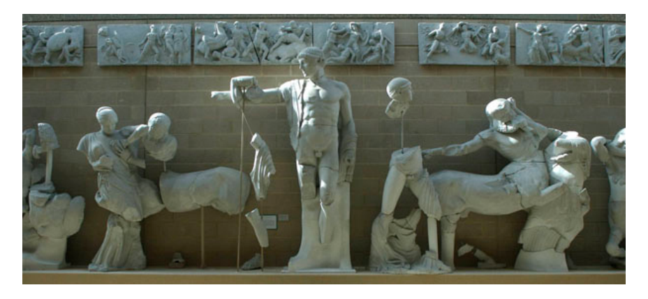
Figure 2. Apollo. West pediment of the Temple of Zeus. Mid-fifth century BCE.

of both animal and human anatomy, while the grey hue of the bodies imitates ancient marble sculptures, which originally in Greece would have been painted in bold and bright colours.