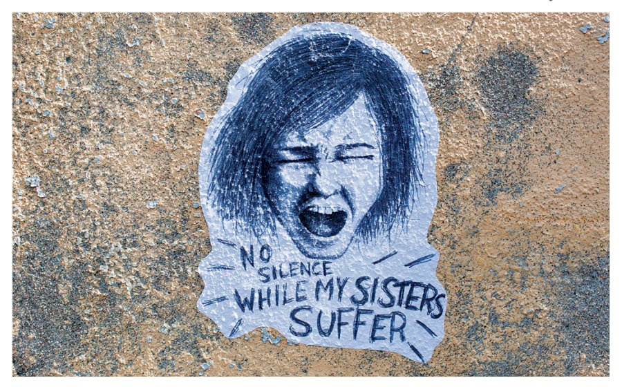
Figure 4. Red Bandit. No Silence While My Sisters Suffer, 2014.