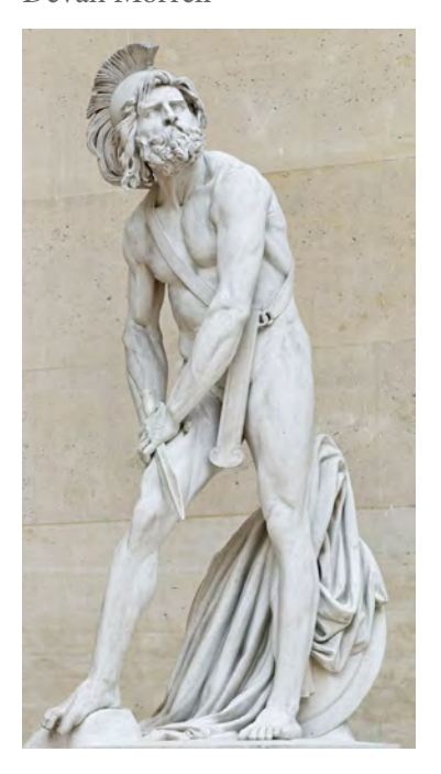
Figure 11. David d'Angers. Philopoemen . 1837.

of this relatively small size has likely been commissioned privately by the building's owner, or funded through a group donation made by the residents of the building. The location of this image, suspended above the speed limit street signs, suggests easy access for community members and pedestrians who can encounter the mural on a leisurely walk through the neighbourhood. Pieces like Philopoemen blessé have often been commissioned with the intent purpose of dissuading graffiti artists from spray-painting the wall with tags and other graffiti styles. In the graffiti subculture, there are a number of unwritten rules and codes of ethics with which most artists comply. In this subculture, writing over someone else's work is seen as