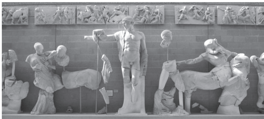
Figure 2. Apollo . West pediment of the Temple of Zeus. Mid-fifth century BCE.

of both animal and human anatomy, while the grey hue of the bodies imitates ancient marble sculptures, which originally in Greece would have been painted in bold and bright colours.