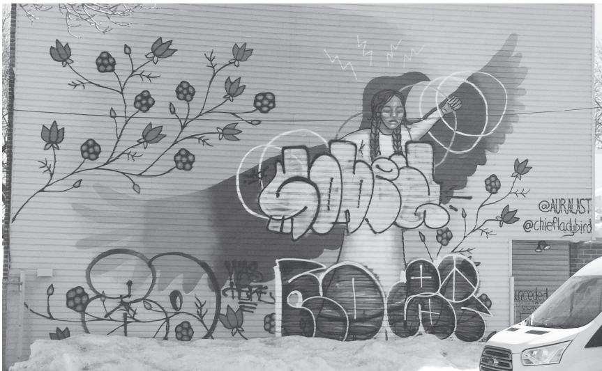
Figure 3. Chief Lady Bird and Aura. Hoop Dancer . 2017.

or male.” 59 While marginalized and/or racialized individuals were not granted access to these spaces, art produced by those communities remained cherished collection items, demonstrating the “history of colonialism that locates such material almost exclusively in anthropological museums and ethnographic collections.” 60 By separating the works from the still-living communities that produced them, museums continued to investigate traditional forms through the Salvage Paradigm, an “anthropological term that describes the notion that it is necessary to preserve the so-called ‘weaker’ cultures from destruction by the dominant culture.” 61 Through this paradigm, Europeans justified their claims to various lands and resources by stating that the natives were lower on the cultural and evolutionary scale. Therefore, Indigenous peoples were considered unqualified to manage their own affairs and, effectively, their own cultural heritage. European paternalism dictated that non-Europeans needed someone with greater knowledge to preserve their culture for them.