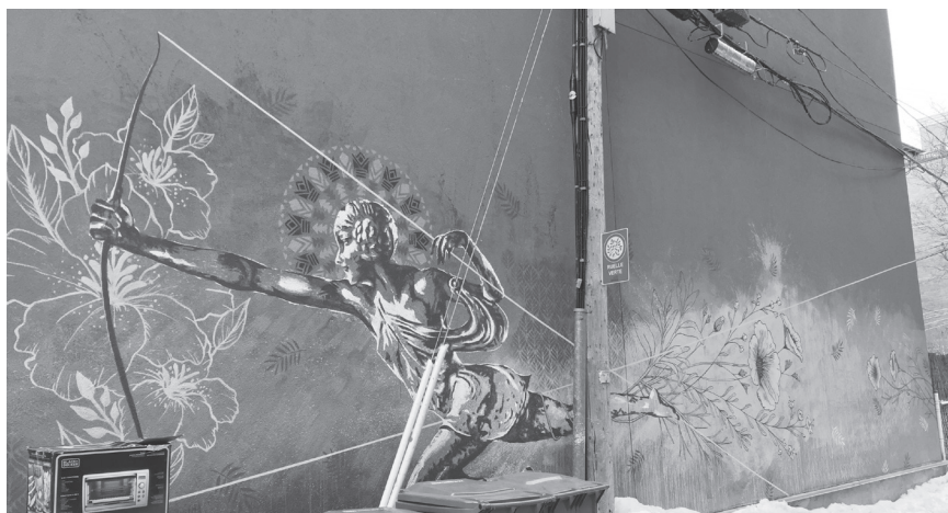
Figure 9. Mateo. La Nature Sauvage D'Artémis . 2018.

La pomme du savoir is meant to be juxtaposed with another of Mateo's pieces called La nature sauvage d'Artémis (2018), 89 which is located in the alley behind the corner of Casgrain and Castelnau ( fig. 9 ). Artemis 90 has a sprig of Myrtle wrapped around her right leg. Myrtle is associated with the goddess of the moon and symbolizes her power to both cause epidemics and source healing. 91 She is shown holding her bow tautly, but her arrow is the one that Minerva, Venus, or the allegorical figure holds in her hand. This is why Mateo suggests that these two images should be considered together – not only to create a scavenger hunt in the city to find and bring these two pieces of the puzzle together, but also to show the balance between global disasters that can lead to food insecurity and malnourishment. 92 Someone without the knowledge of Greco-Roman imagery, who walks along the street, meanwhile, may see this image as a warrior woman defending and protecting the natural world. That said, no interpretation is automatically wrong or invalid, even if it deviates from the artist's original intention.