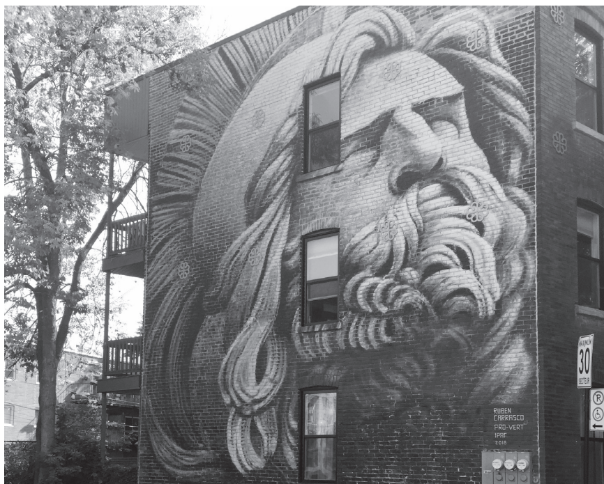
Figure 10. Carrasco, Gillot, and et. al. Philopoemen Blessé . 2016.

and Jamaica who work in the agricultural sector. It has been said that not only do migrant workers fall into debt coming to Canada in order to participate in these work programs, but once they arrive, they experience unsafe and abusive work conditions (including sexually harassment), their wages are often reduced without explanation, and they are subjected to other forms of exploitation. 96 Often the most vulnerable communities, such as migrant workers, refugees and newly settled immigrants, are the communities most likely to experience food insecurity, and so it is possible that La pomme du savoir is visually rebuking the market-goers for the abundance of reasonably-priced food that locals and tourists alike can buy from local farmers when as local community members go hungry.