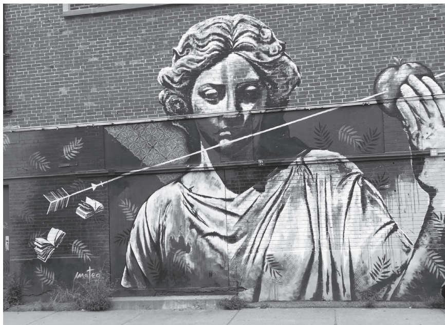
Figure 7. Mateo. La pomme du savoir . 2017.

Greco-Roman post-graffiti art provides a hope for new global opportunities, such as supporting and helping to facilitate other polytheistic figures and themes from around the world that have been suppressed. These post-graffiti projects affirm the impact nature and art have on one another and demonstrate the transformative qualities of the landscape. They also highlight the histories and identities of both the artists who created these pieces and residents, in whose communities the art has been created and displayed. As such, Greco-Roman and Canadian Indigenous post-graffiti art perform in tandem to express the complex historical context of the city.