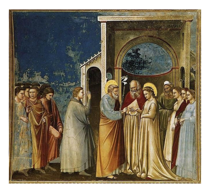
Figure 1: Giotto, Marriage of the Virgin , Scrovegni Chapel (Arena Chapel), Padua, c. 1303.