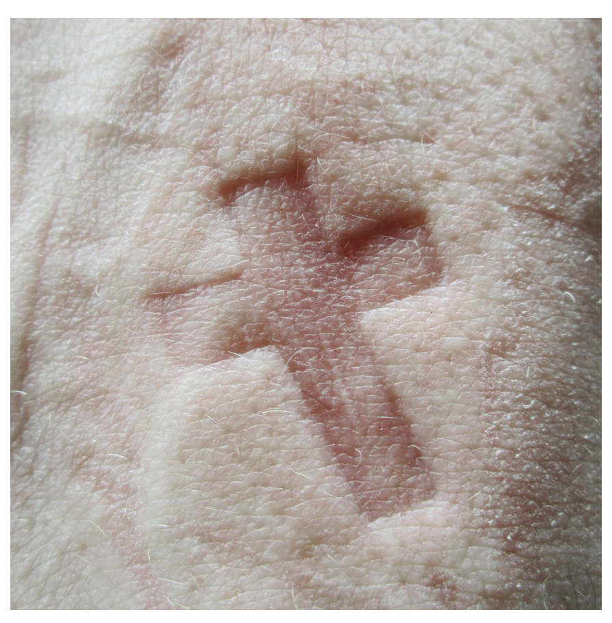
Étienne Camille Charbonneau, \it Stigmates , 2014, digital prints, 18"x18" (diptych).